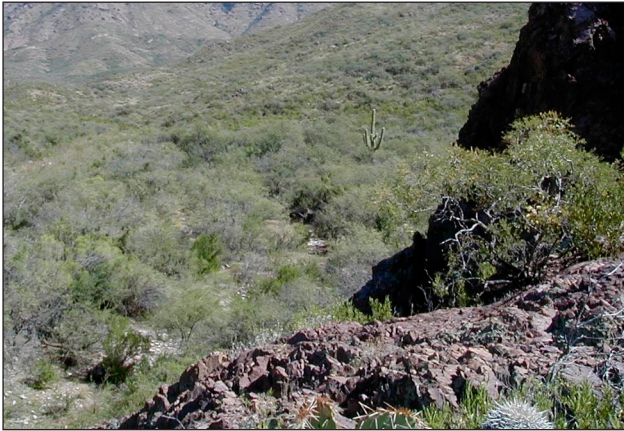
Scott Bailey/Tohono O'odham Nation

Habitat: shaded areas of canyons at approximately 3,500 ft (1067 m) elevation.