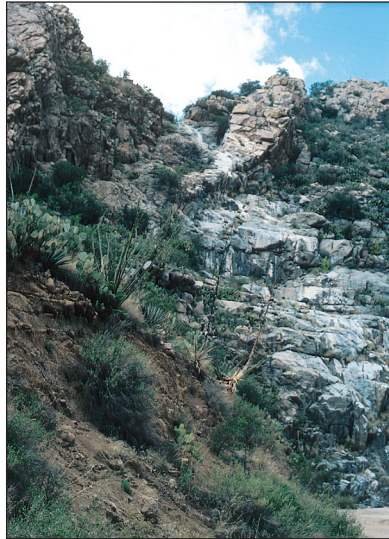
C. David Bertelsen

Habitat: rocky slopes in grassland and oak woodland canyons and along stream courses, 2,800-6,000 ft (854-1829 m) elevation.