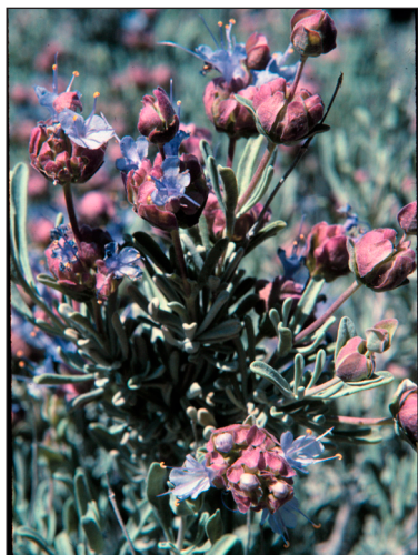
Salvia dorrii ssp. mearnsii