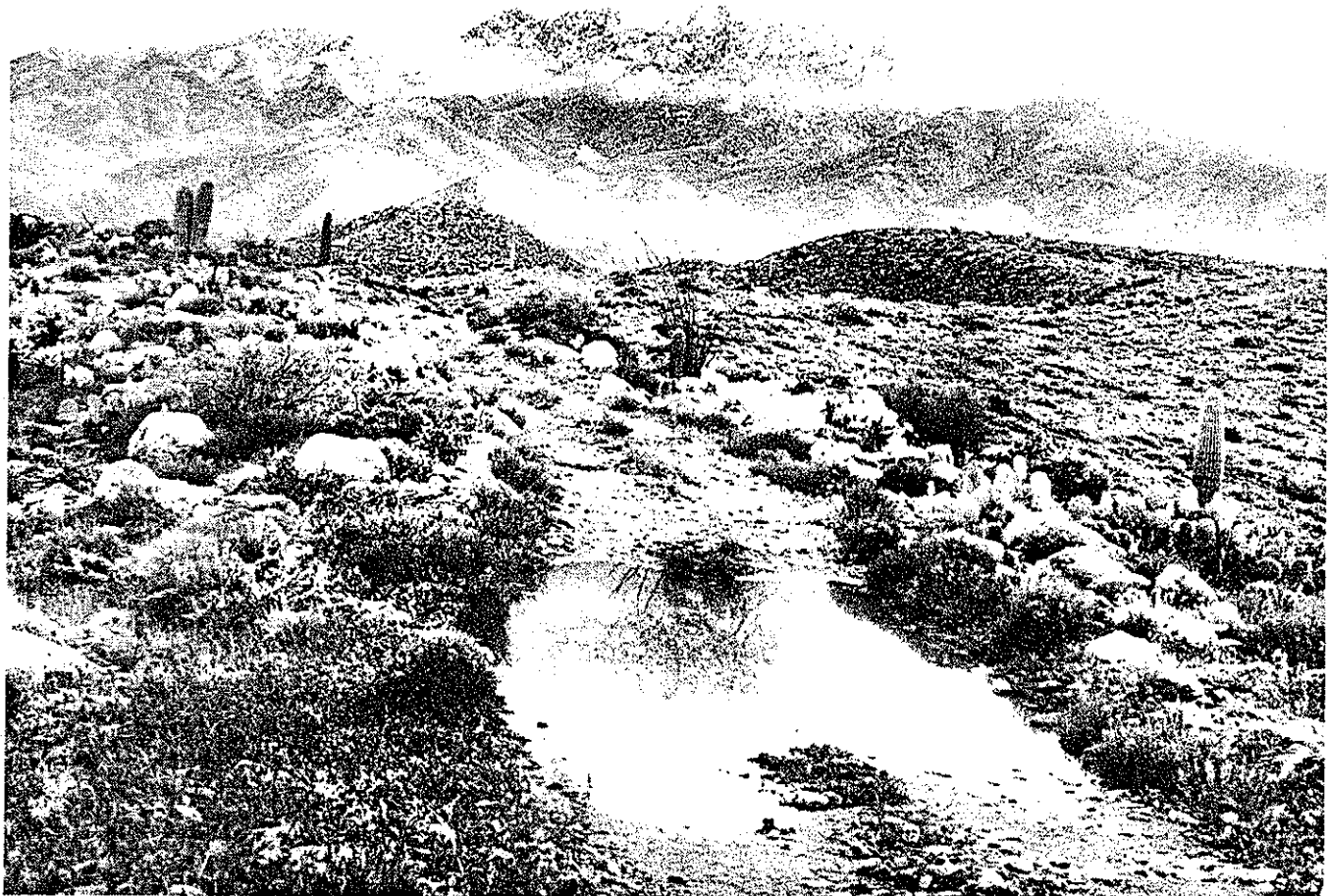
Pristine desert meets the snow-capped Four Peaks in the Mazatzal Mountains, 2½ hours northeast of Phoenix.