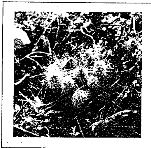
Mammillaria thornberi Thornber's Fishhook proposed threatened.

Congress is once again considering reauthorization of the Endangered Species Act (ESA). Without Congressional action the authority to spend federal money to protect endangered species will expire in October. Several conservation organizations are working cooperatively to ensure reauthorization of a strong ESA. Their joint newsletter, Endangered Species Reauthorization Bulletin (ESARB), addresses a variety of issues concerning endangered species conservation. The following excerpts from two recent issues outline the provisions of the ESA and the plant-related issues that will receive congressional attention this year.