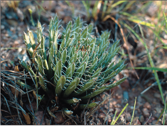
Agave parviflora ssp. parviflora