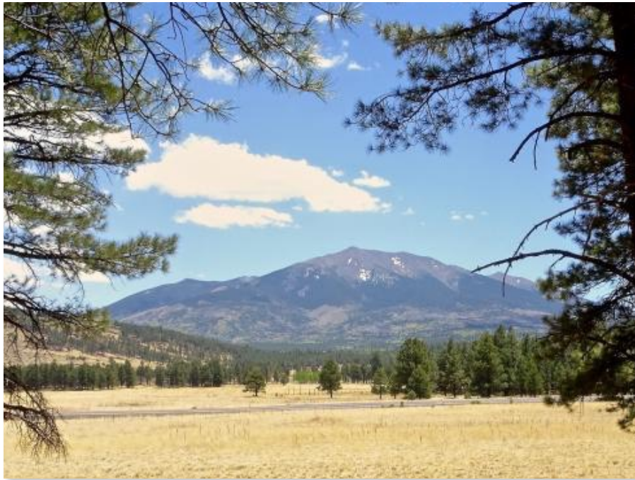
Kendrick Park.