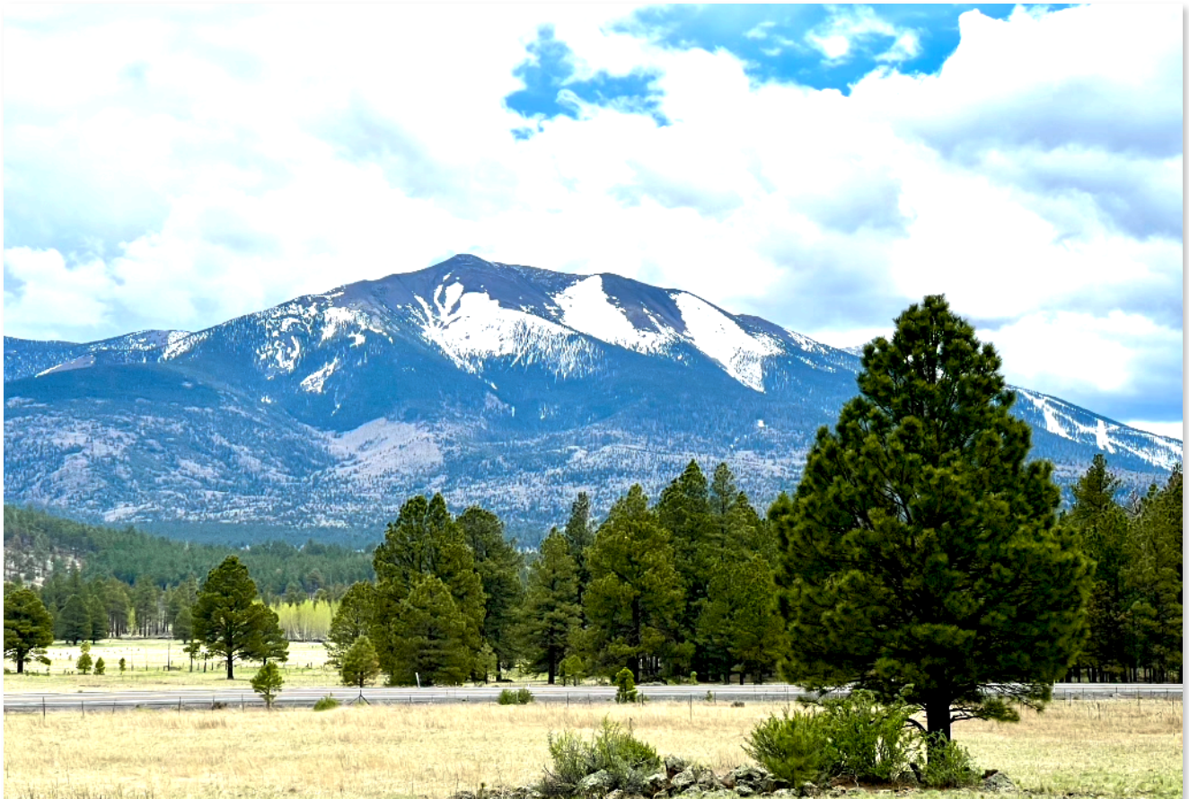
San Francisco Peaks, Flagstaff.