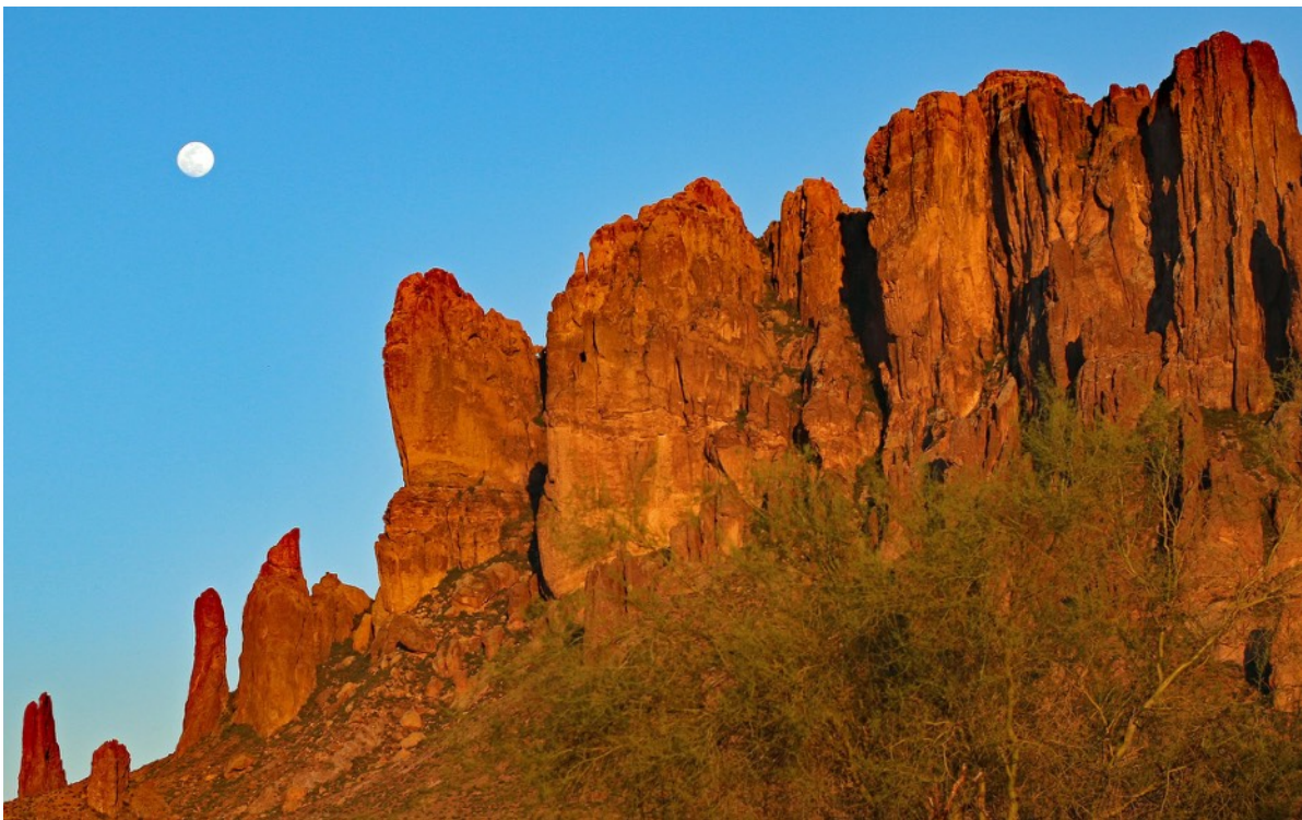
Superstition Mountains.