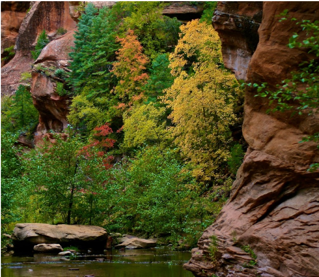
West Fork, Oak Creek Canyon.