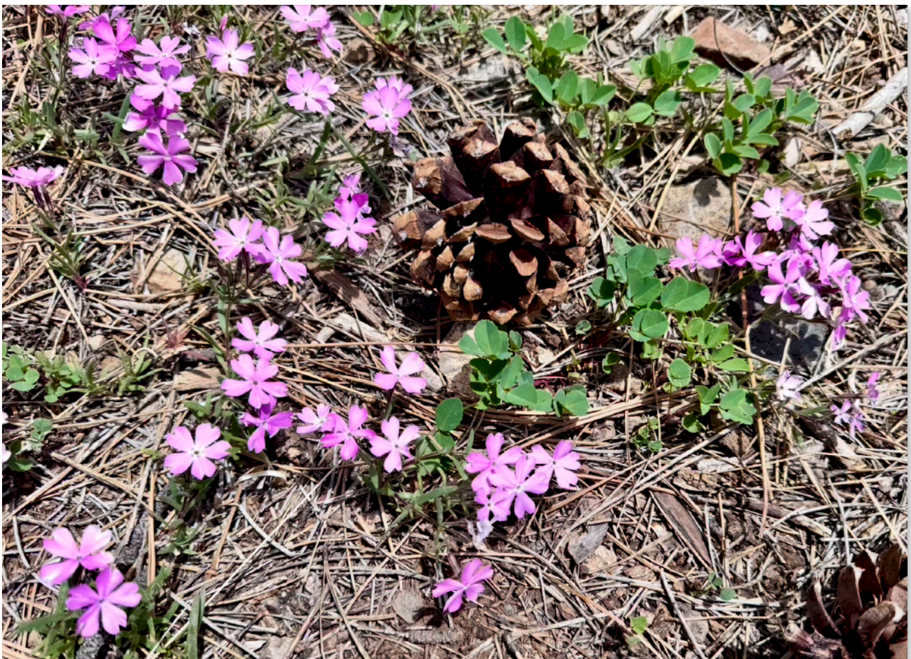
Woodhouse's phlox ( Phlox woodhousei ).