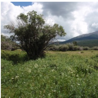
Bebb's Willow.

Bebb's Willow ( Salix bebbiana ) populations in the lower Four Corners states are rare and isolated due to a number of climatic factors including global warming and glacial retreat. Located on the San Francisco Peaks, Arizona's largest stand of Bebb's Willow has historically flourished, but is currently at risk of extirpation. Due to a lack of reproductive success, prevalence of stand replacing fire and inconsistent precipitation, there has been very little seedling recruitment over the past century and 0% recruitment recorded in the past three decades. The NAU Research Greenhouse in collaboration with The Nature Conservancy are taking steps to help preserve the existing Bebb's trees and restore fresh seedling to the area.