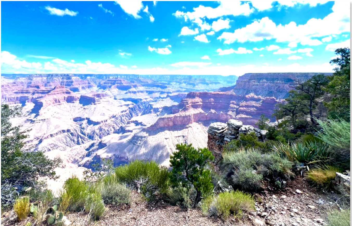
South Rim, Grand Canyon.