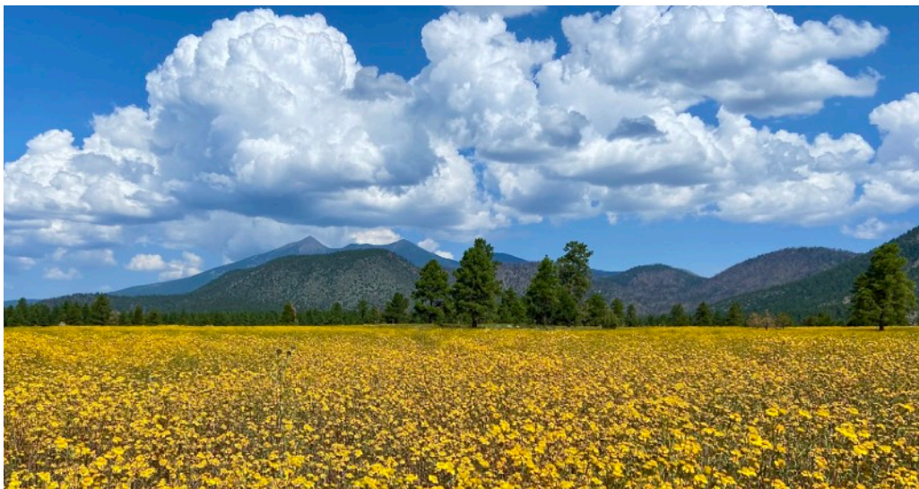
Buffalo Park, Flagstaff.