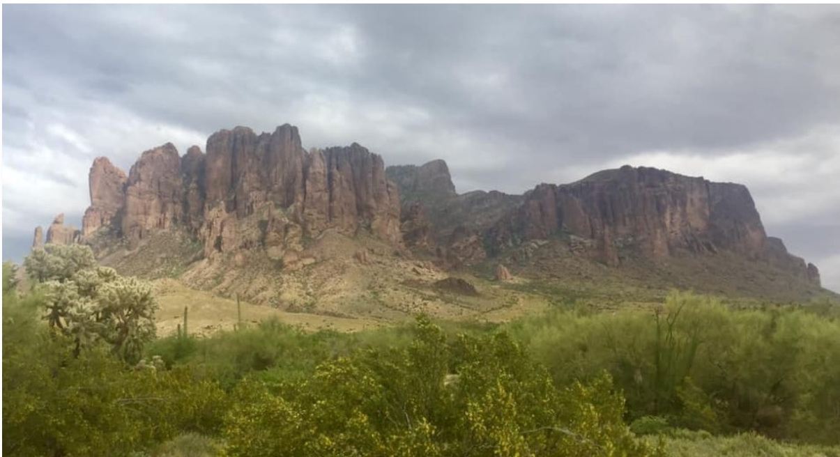
Superstition Mountains.