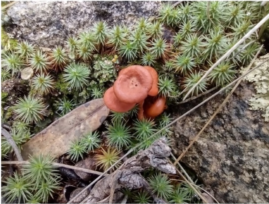
Juniper haircap moss with a mushroom centerpiece.