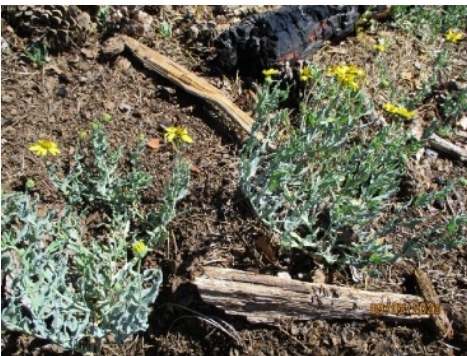
Arizona sunflower.