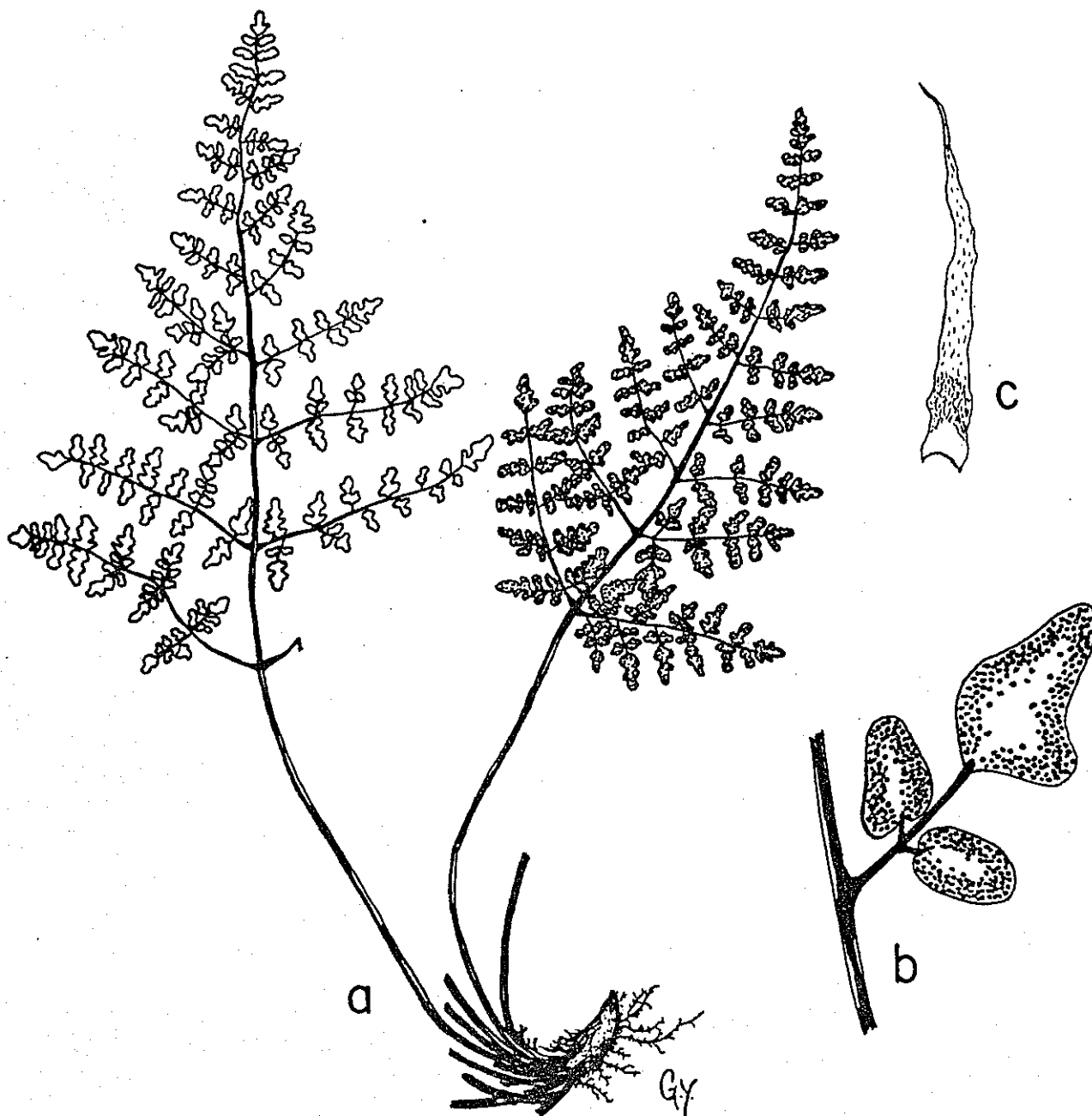
Figure 1: Notholaena incana Presl: a. habit, X1; b. undersides of fertile segments, X9; c. rhizome scale, X13. All drawn from Windham & Yatskievych 81-93.