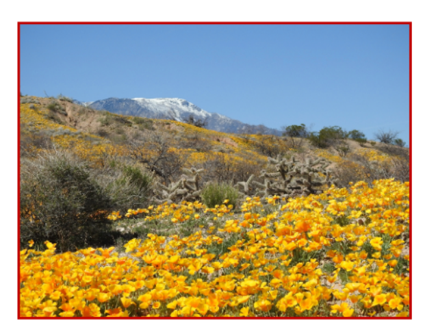
Pinaleño Mountains Graham County, AZ