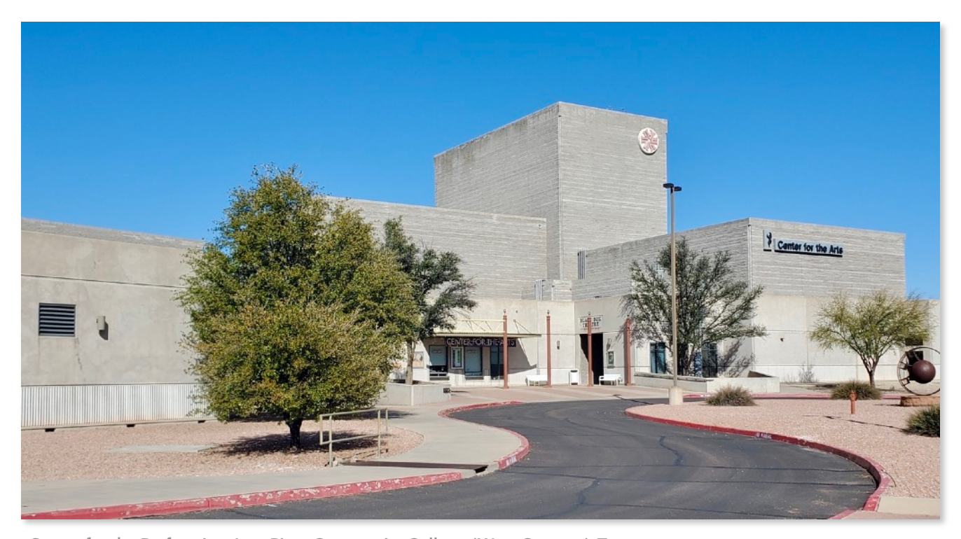
Center for the Performing Arts, Pima Community College (West Campus), Tucson.

The conference committee is currently developing ideas for a conference theme and lining up potential speakers. Specific details about the conference agenda and registration information will be made available soon on the AZNPS website and through direct communications to Chapters and individual members.