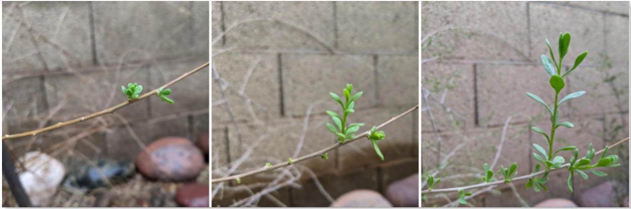
Wolfberry (Lycium), a wonderful native landscaping shrub, springing back into life after the July monsoon rains.