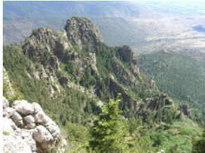
Sandia Mountains.