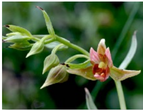
Epipactis gigantea.