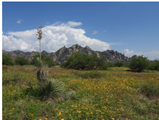
Arizona Poppies, Caltrop ( Kallstromia grandiflora) after the start of the Monsoon Rains in the Dragoon Mountains, Cochise County.