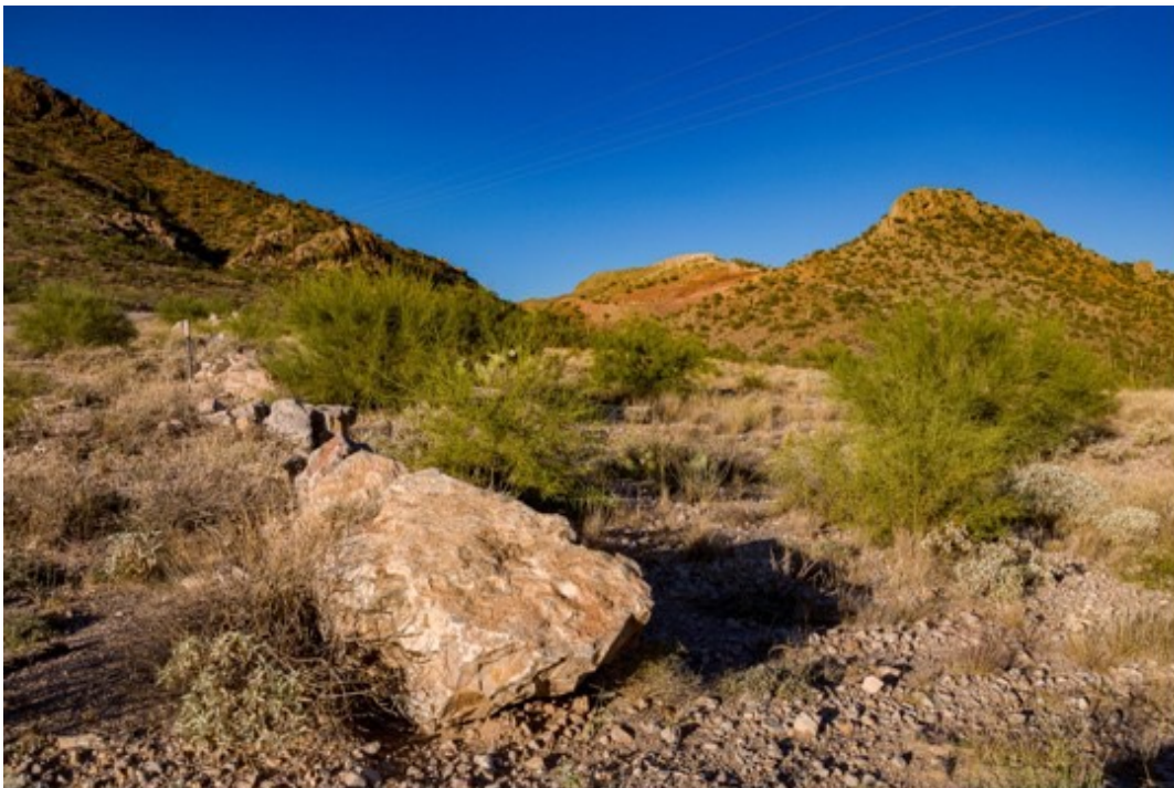
Ironwood Forest National Monument