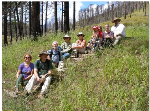
From top left: Barfoot Park; Chiricahua Mountains; Southwestern Research Station; Rustler Park