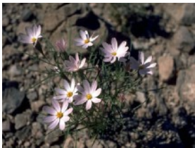
Southwestern cosmos ( Cosmos parviflorus ).

Aster Family Workshop at Highlands Center for Natural History September 23, 8:00 AM - 1:00 PM. Pre-registration required. Visit the website to register ( https://aznps.com/chapters/prescott/ ).