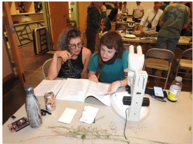
Left to right: Barfoot Park; Plant ID Lab, Southwestern Research Station