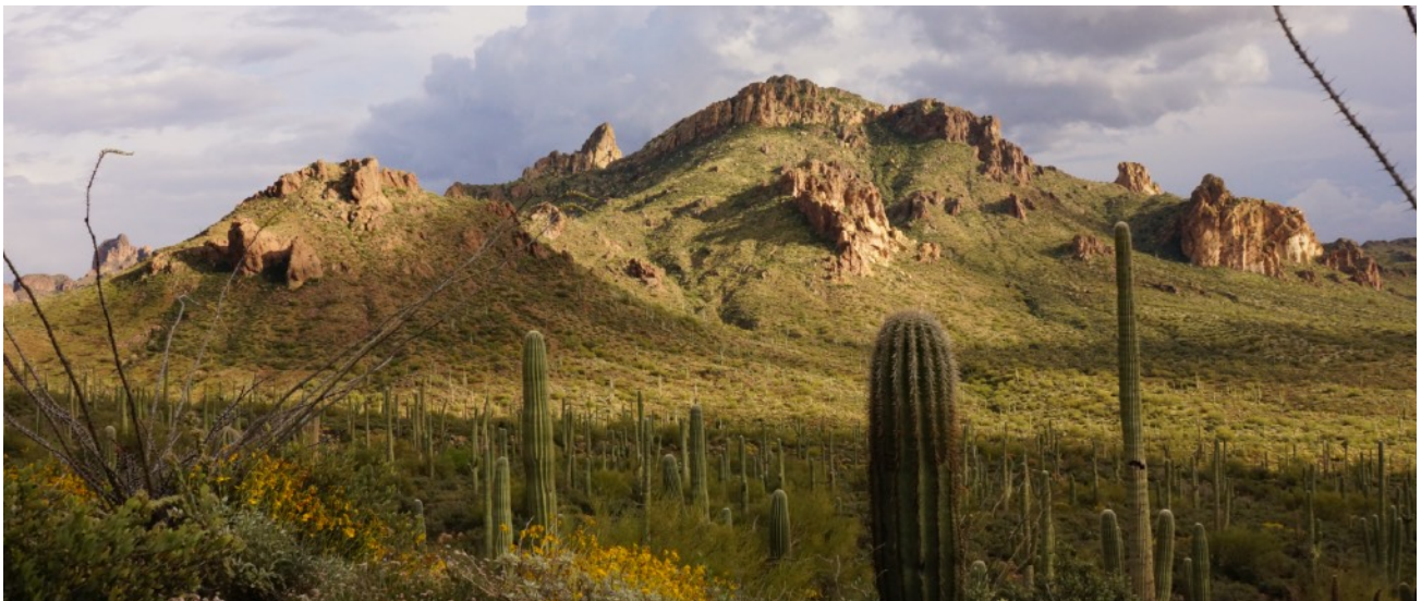
Superstition Mountains.