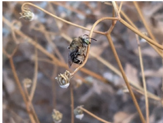
Even when no longer flowering in the summer, Brittlebush ( Encelia farinosa) is loved by native insects, such as Marine blue butterflies and California digger bees.