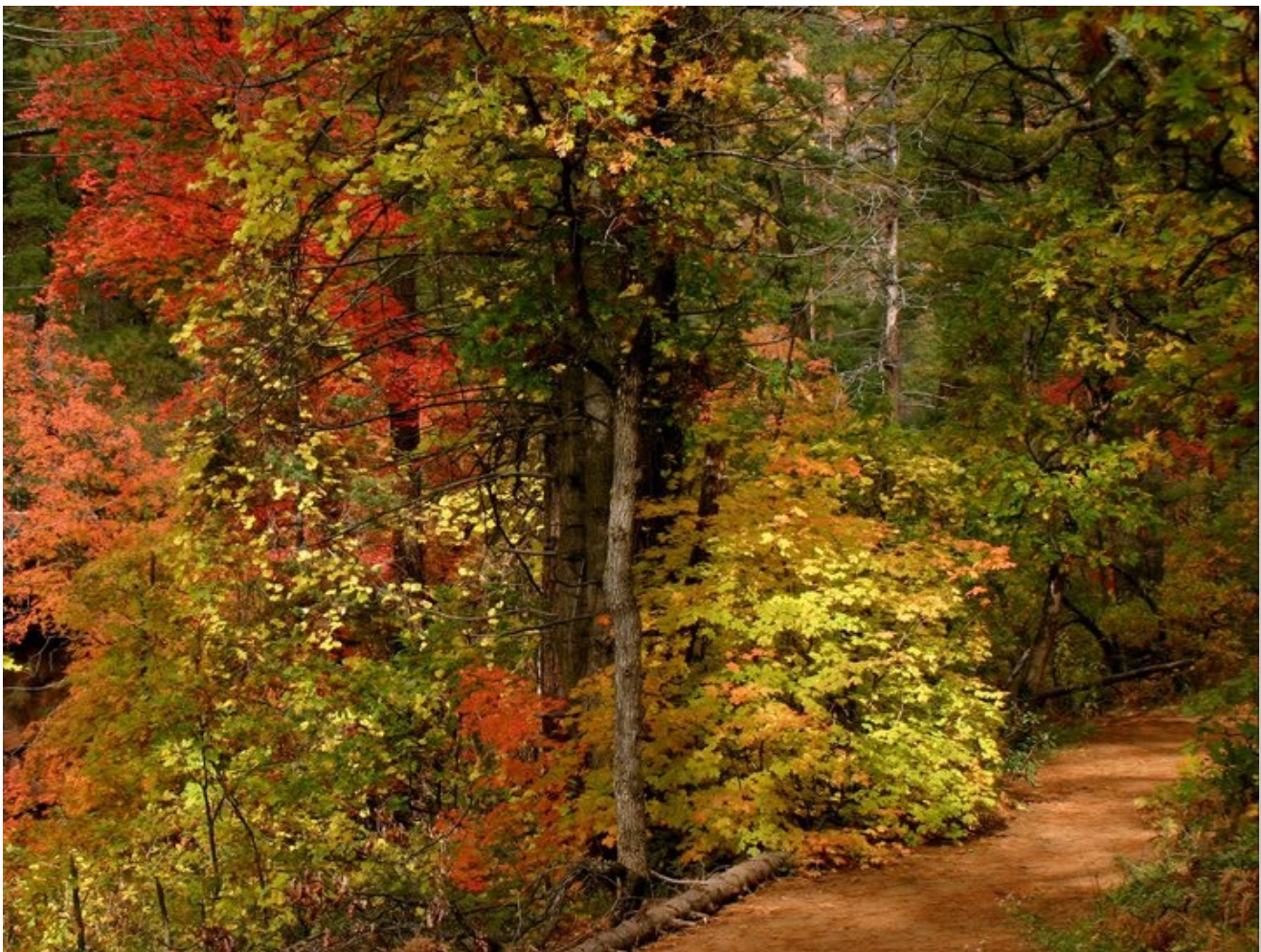
West Fork, Oak Creek.