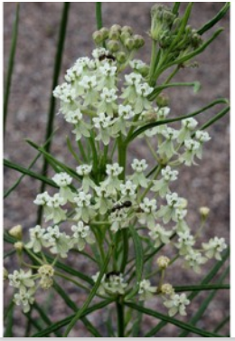
Whorled milkweed ( Asclepias verticillata ).

Contact the chapter about volunteer opportunities, which will be focused this fall on milkweed seed planting and monitoring.