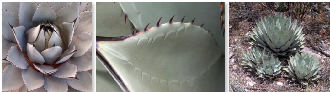
Parry's Century-Plant ( Agave parryi).