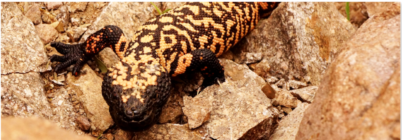
Gila monster ( Heloderma suspectum), Superstition Mountains.