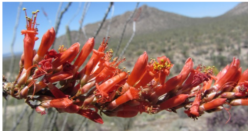
Ocotillo ( Fouquieria splendens), Tortolita Mountains.