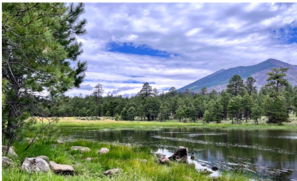
Schultz Tank, Flagstaff.