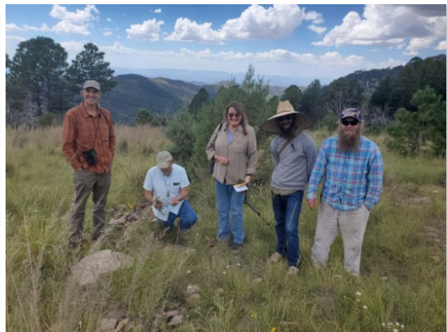
Annual Chiricahua Weekend