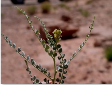
Round-leaf dune-broom ( Errazurizia rotundata).

In just a few pockets along the LCR, the imperiled Errazurizia rotundata quietly sits in sandstone outcroppings. It is one of four legumes in the genus Errazurizia , which has a disjunct distribution across the New World tropics. The other errazurizias live in narrow ranges in the deserts of Chile, Baja California, and northern Mexico. This talk will outline the historical focus on this genus and its evolutionary relationships, and the present-day work that clarified generic boundaries of this group.