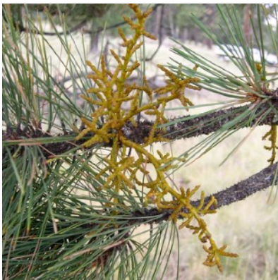
Pineland dwarf mistletoe ( Arceuthobium vaginatum ).

There are a variety of pathogens that influence forest health in Arizona, ranging from fungi to parasitic plants, both native and introduced. This presentation will focus on some of the common pathogens which affect Arizona's forests. Topics covered will include basic biology, effects on host tree species, as well as management.