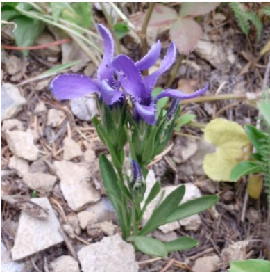
Perennial fringed-gentian ( Gentianopsis barbellata).

Come learn about 10 rare plants growing on the San Francisco Peaks and Mt. Elden that haven't been collected in decades. The Museum of Northern Arizona and The Arboretum at Flagstaff are starting a program to train citizen scientists to search for and monitor rare plants that haven't been found in years. You can help land managers safeguard these rare plants by finding them in the wild and checking on their condition.