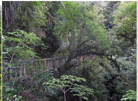
From left to right: Arthur Pass, Orakei Korako Park, Ruakuri.