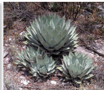
Parry's Century-Plant ( Agave parryi).