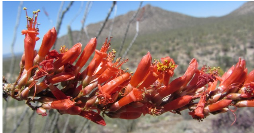
Ocotillo ( Fouquieria splendens), Tortolita Mountains.