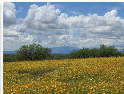
Orange caltrop ( Kallstroemia grandiflora ), Dragoon Mountains. Summer 2021