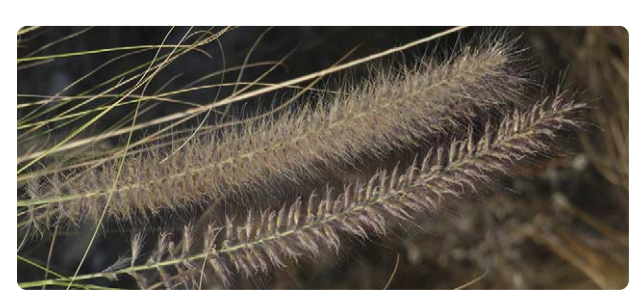
Fountain Grass spike.

The stems all grow from crown tissue just below the ground surface. Each year the base diameter increases and the stems become more numerous.