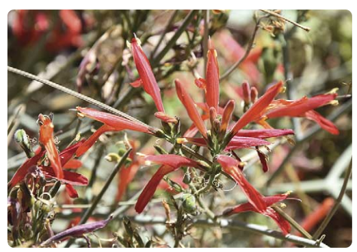
Chuparosa is a beautiful native alternatives to fountain grass (see inside for more information).

btarboretum.org friendsofthetonto.org mcdowellsonoran.org